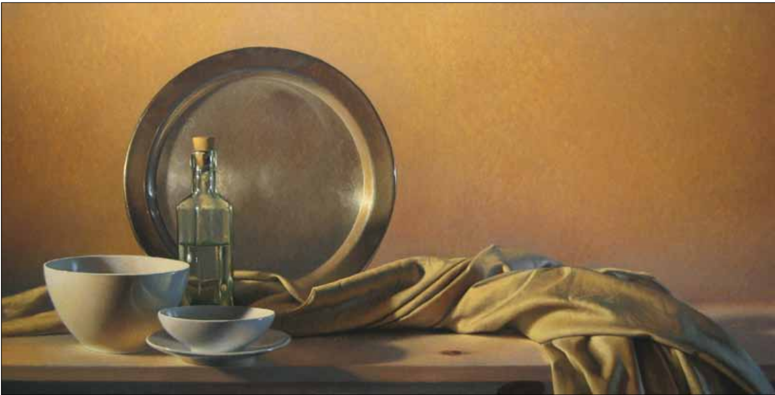
Top - Silver Plate, oil, 16" by 32"

"I needed a fairly large object for my compositional idea, and I didn't have one suitable. So I took this silver plate and set it on edge, leaning it slightly on a brick I set upright behind it. That big, clear circle is just what I needed to set up the rest of the design."