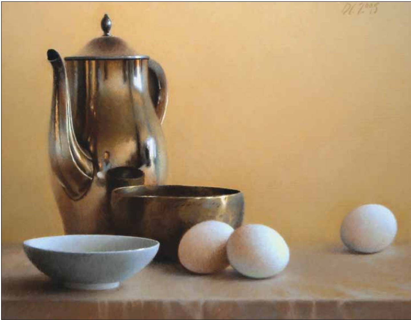
Common Things, oil, 11" by 14"

"I've really been surprised by the reactions I've gotten to this little piece, which is largely a study in soft natural light. It won the Hunter Editions Award of Excellence at the 2009 OPA National Show and has earned me a commission by a couple who are after something with a similar feel. I guess our off-hand comments can sometimes be much more powerful than our prepared speeches."