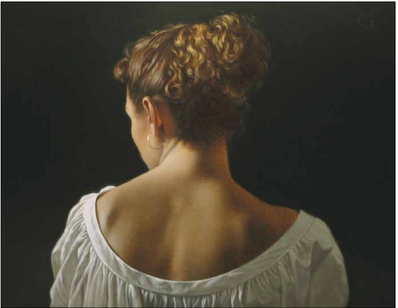
Light's Caress, oil, 12" by 16"

"This is my beautiful wife again. I really enjoyed translating the subtle nuances of form created by the raking light brushing across her back. Challenging, but enjoyable."