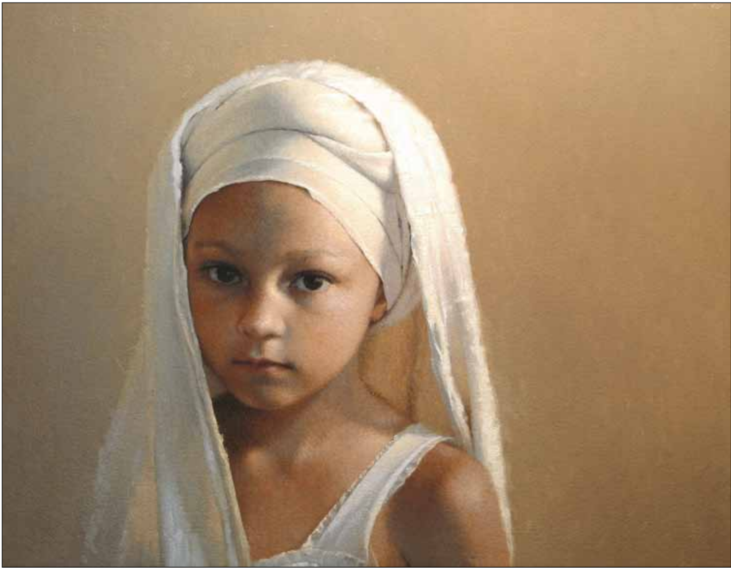
Girl, oil, 12" by 16"

"Most of the time I would rather not title my paintings at all. I suppose Girl is the closest I'll ever get to that. Those eyes say everything that needs saying."