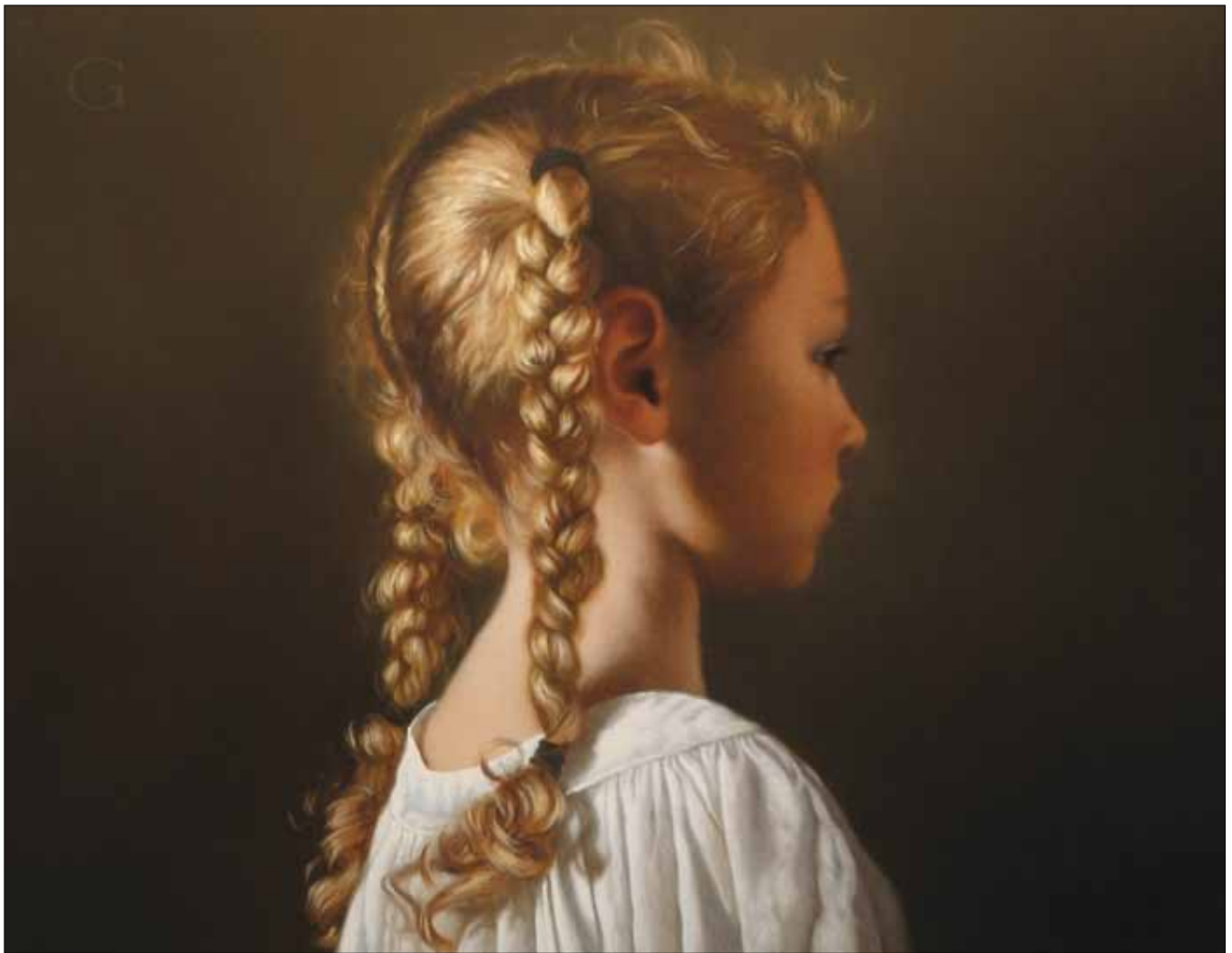
Braids, oil, 11" by 14"

"This doesn't sound very sophisticated of me, but I think braided pigtails are the cutest things. This is my daughter. I love the play of light on all the little shapes formed by her golden braids."