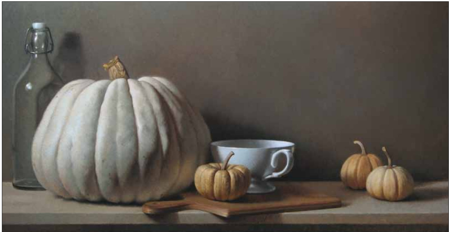
Bottom - October Shapes, oil, 14" by 28"

"I needed a fairly large object for my compositional idea, and I didn't have one suitable. So I took this silver plate and set it on edge, leaning it slightly on a brick I set upright behind it. That big, clear circle is just what I needed to set up the rest of the design."