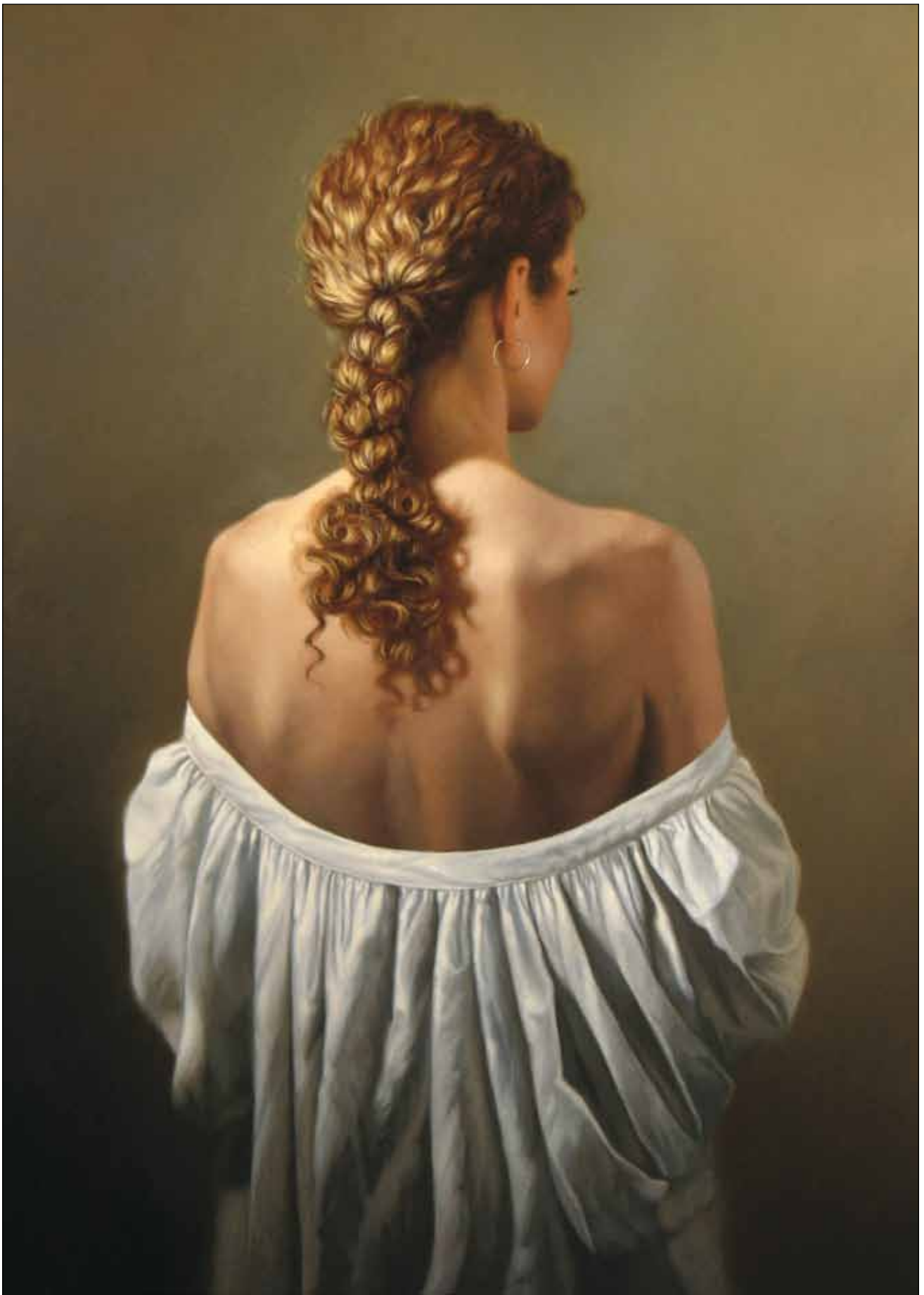
Angel, oil, 30" by 20"

"Sometimes I feel I could be perfectly content to paint my wife's beautiful back for the rest of my life. The title refers not only to her character, but also to the folds of the shirt, which to me seemed feather-like and made me think of an angel's wings."