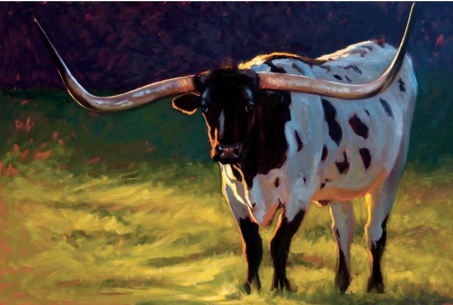
Lone Ranger , oil on board, 40 x 60"