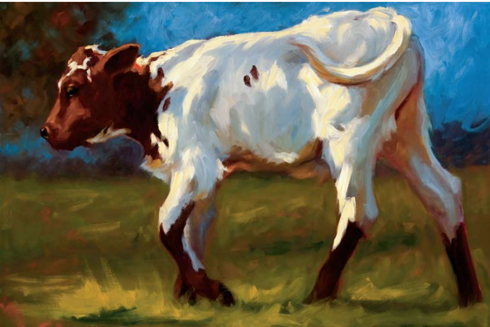
A Clear Blue Afternoon , oil on board, 24 x 36"

and feel of the animal. Technically I'm doing that with more abstract or softened backgrounds. I'm keeping the animals sharper and the background more blurry."