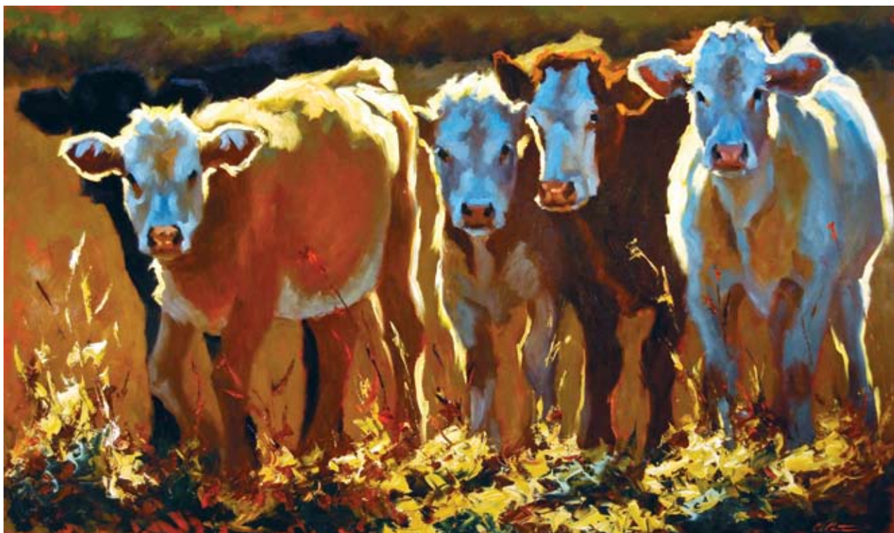
Rabble Rousers , oil on board, 36 x 60"