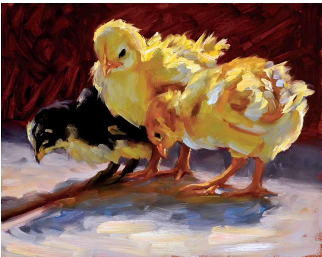
Do You See It? , oil on board, 8 x 10"