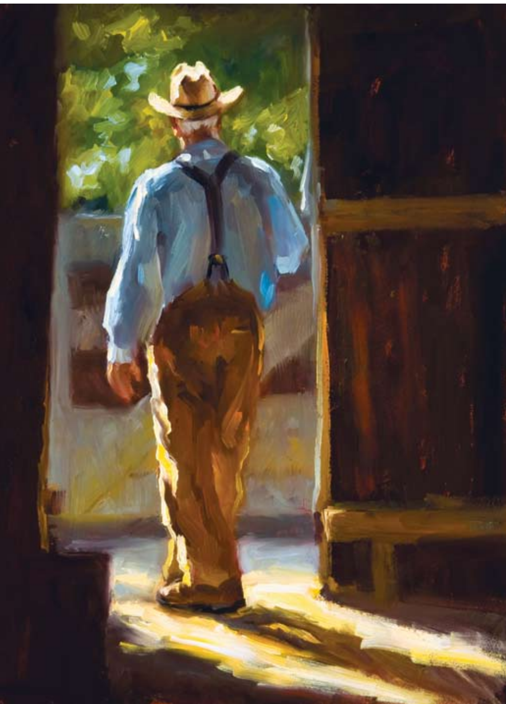
Ole McDonald , oil on board, 12 x 9"